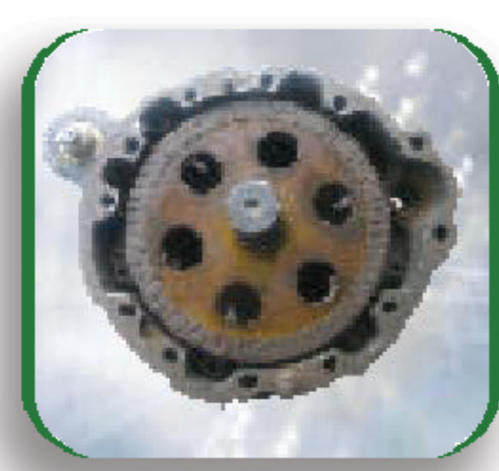
Oil Immersed Dis Brakes