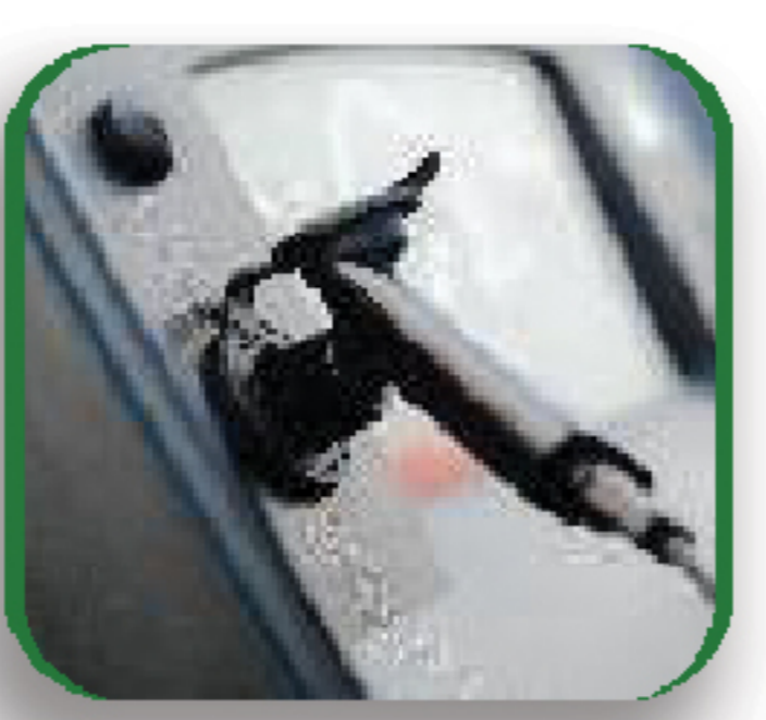
Mobile Charger with Holder