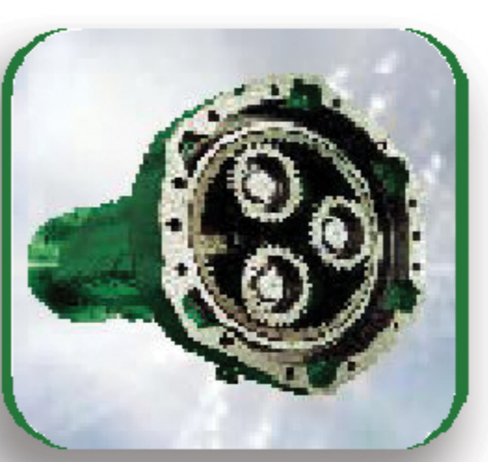
Planetary Gear with Straight Axle